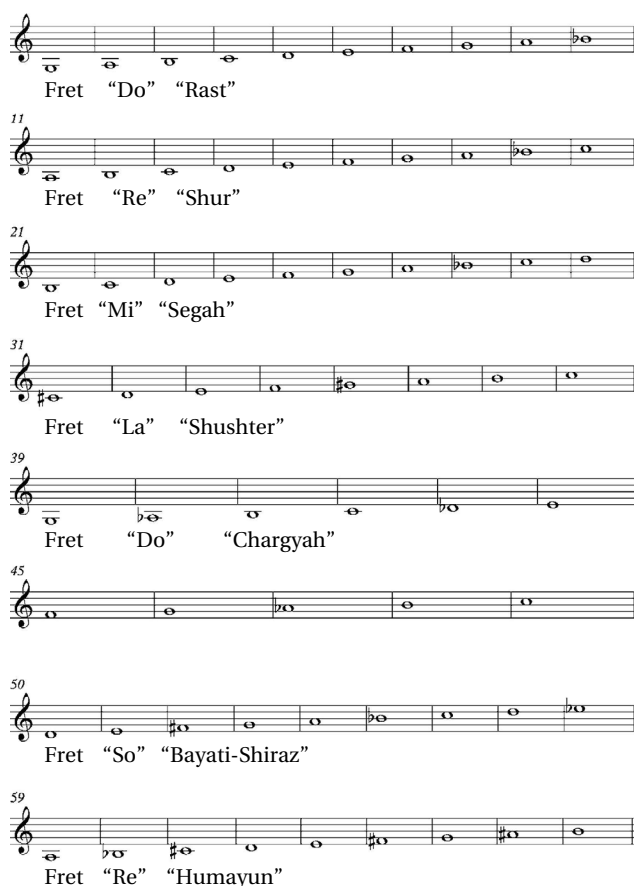
Figure 2. Fret system of Azerbaijani folk music

by the nature of thinking of the inhabitants of the Middle East. It reflects a person's communication alone with the Lord, prayer to Him. The monody was performed both vocally and instrumentally. One of the most famous instruments of this area throughout history was the tar. Both types of interpretation were distinguished by the richness of various intonation and rhythmic figures, which represent a unique form of national melismatics, reminiscent of forshlag, trill, rehearsal of a certain tone of melody. The ethnic traditions of Azerbaijan also led to the creation of music within a certain original fret system. Its foundation is based on seven sound rows (Fig. 2).