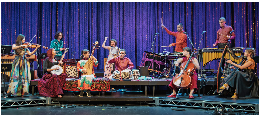
Figure 2. American Railroad Silkroad Ensemble with Rhiannon Giddens