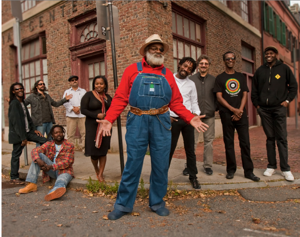
Figure 3. Some participants recording the song “Stand by Me”

editing and sound engineering, as it was necessary to combine recordings made in different conditions, with different sound levels and instrumental parts. Despite these challenges, the end result was extremely successful, demonstrating the possibility of creating a high-quality musical product even in such unconventional conditions (Fig. 3).