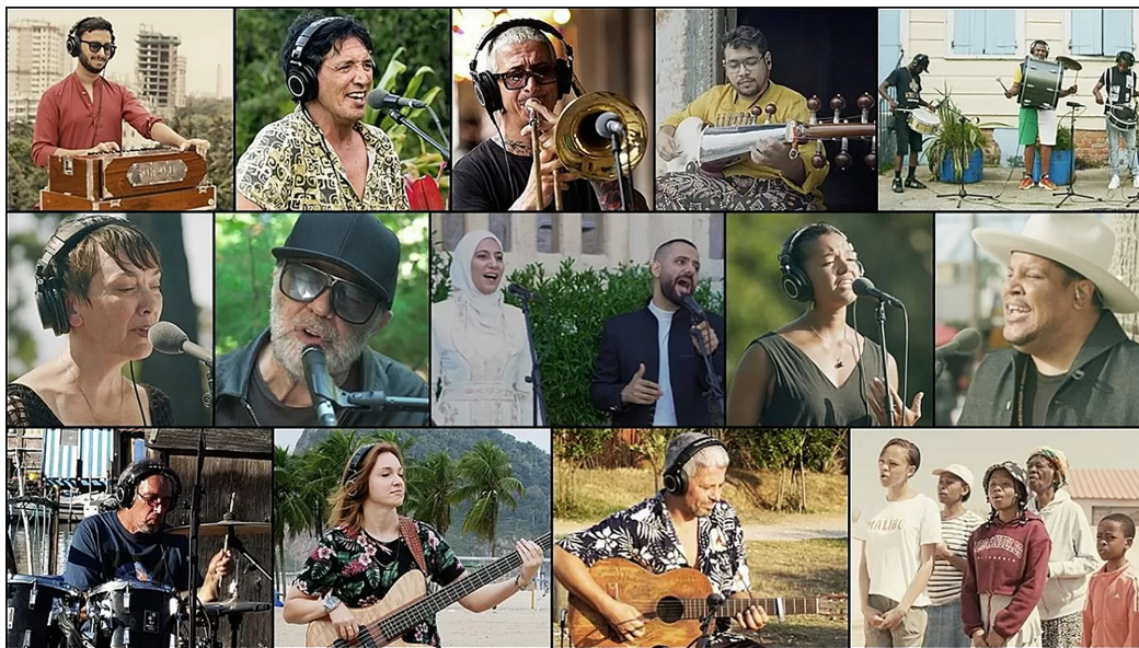
Figure 4. Musicians from the Playing for Change project